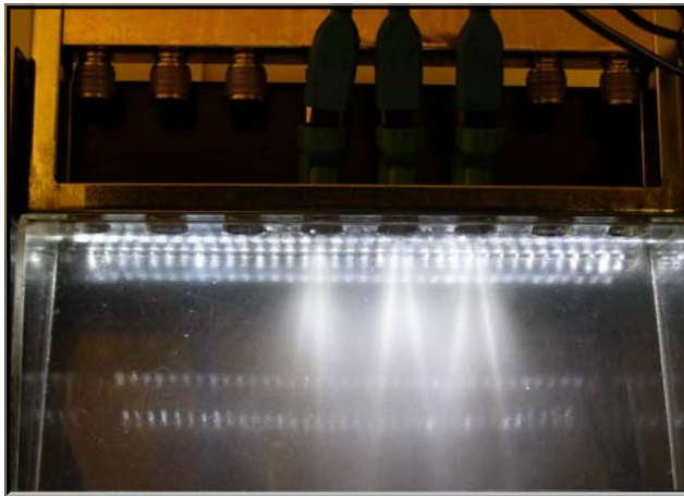
Spray Pattern Post-Cleaning